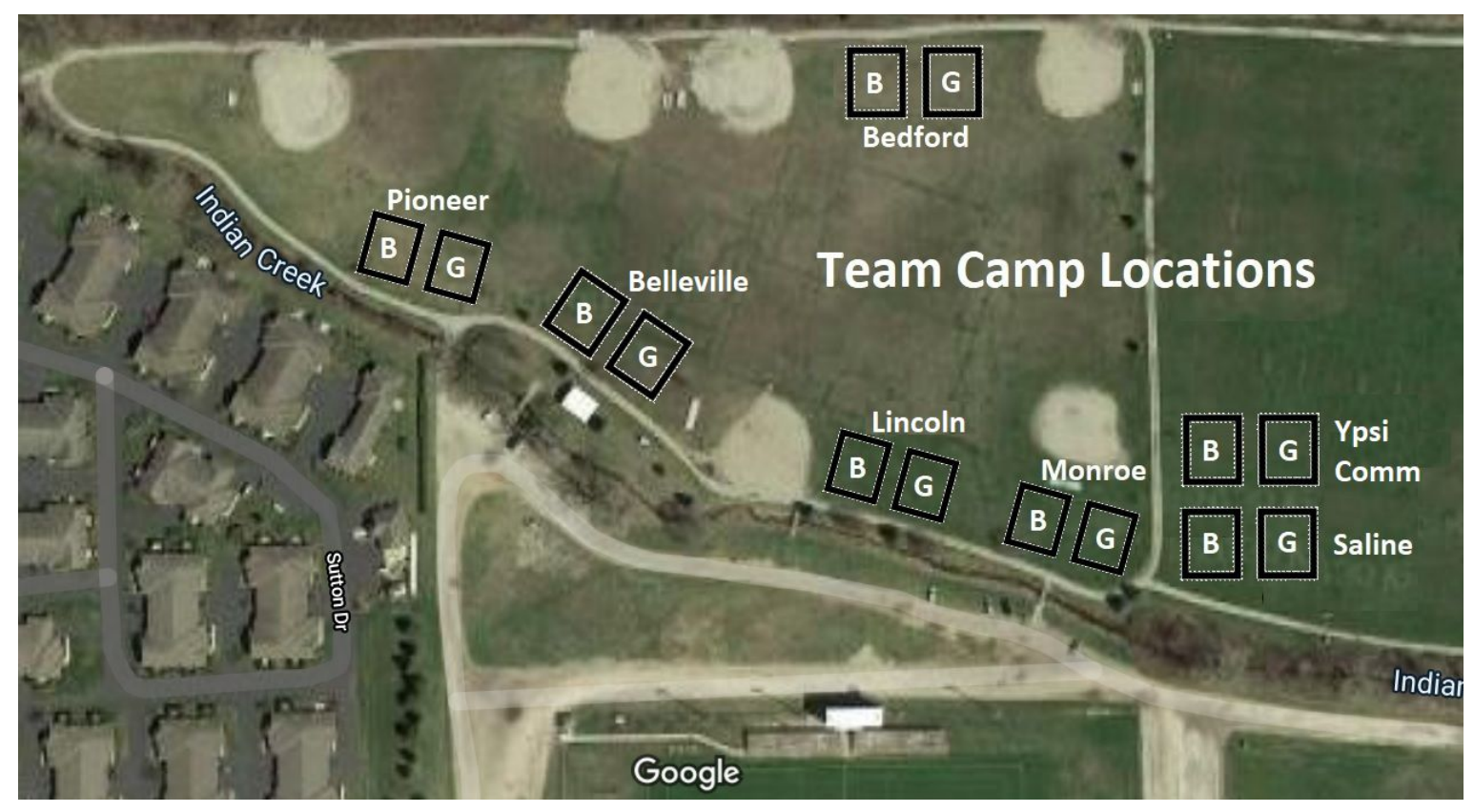
***NO SPECTATORS IN THE TEAM CAMP AREA***